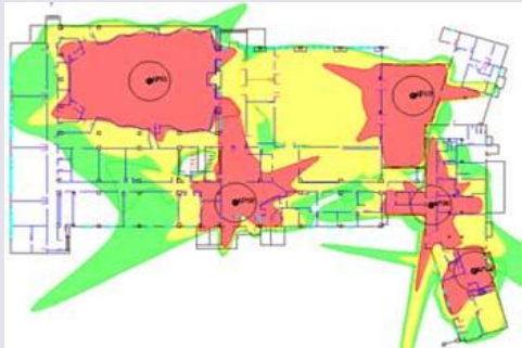
Wireless Engineering Planning & Design