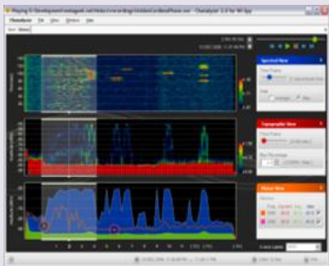
Health Checks for Existing Deployments